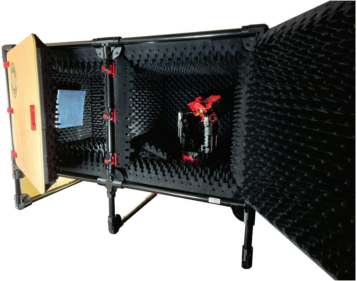
Millibox MBX32CTR system